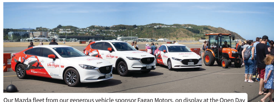
Our Mazda fleet from our generous vehicle sponsor Fagan Motors, on display at the Open Day