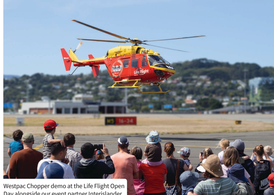
Westpac Chopper demo at the Life Flight Open Day alongside our event partner Interislander