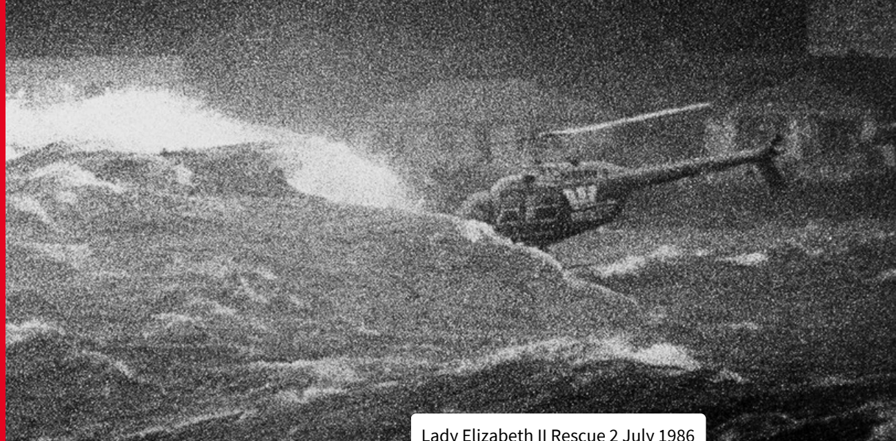
Lady Elizabeth II Rescue 2 July 1986