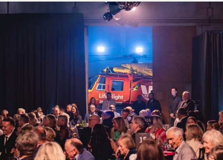
LEFT: Life Flight Gala

to the organisers for the incredible mahi that went into making these events such a success.