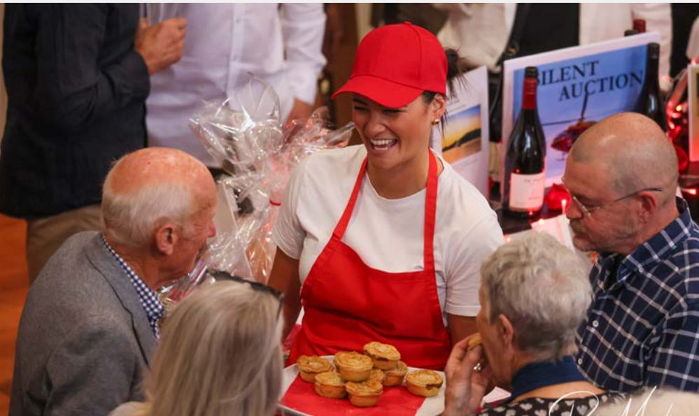
LEFT: Uplift Wairarapa