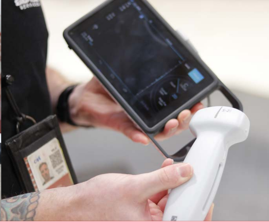
LEFT: Total overhaul of Pratt and Whitney engines.