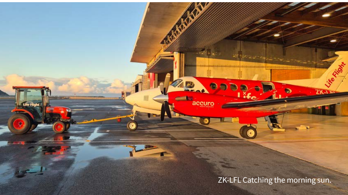
ZK-LFL Catching the morning sun.

Each Air Ambulance plane is now fitted with a Medical Air Pump. These are a piece of specialist equipment needed to transport babies in incubators to the critical care they need.