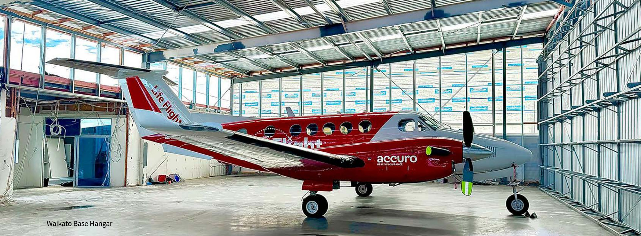
Waikato Base Hangar