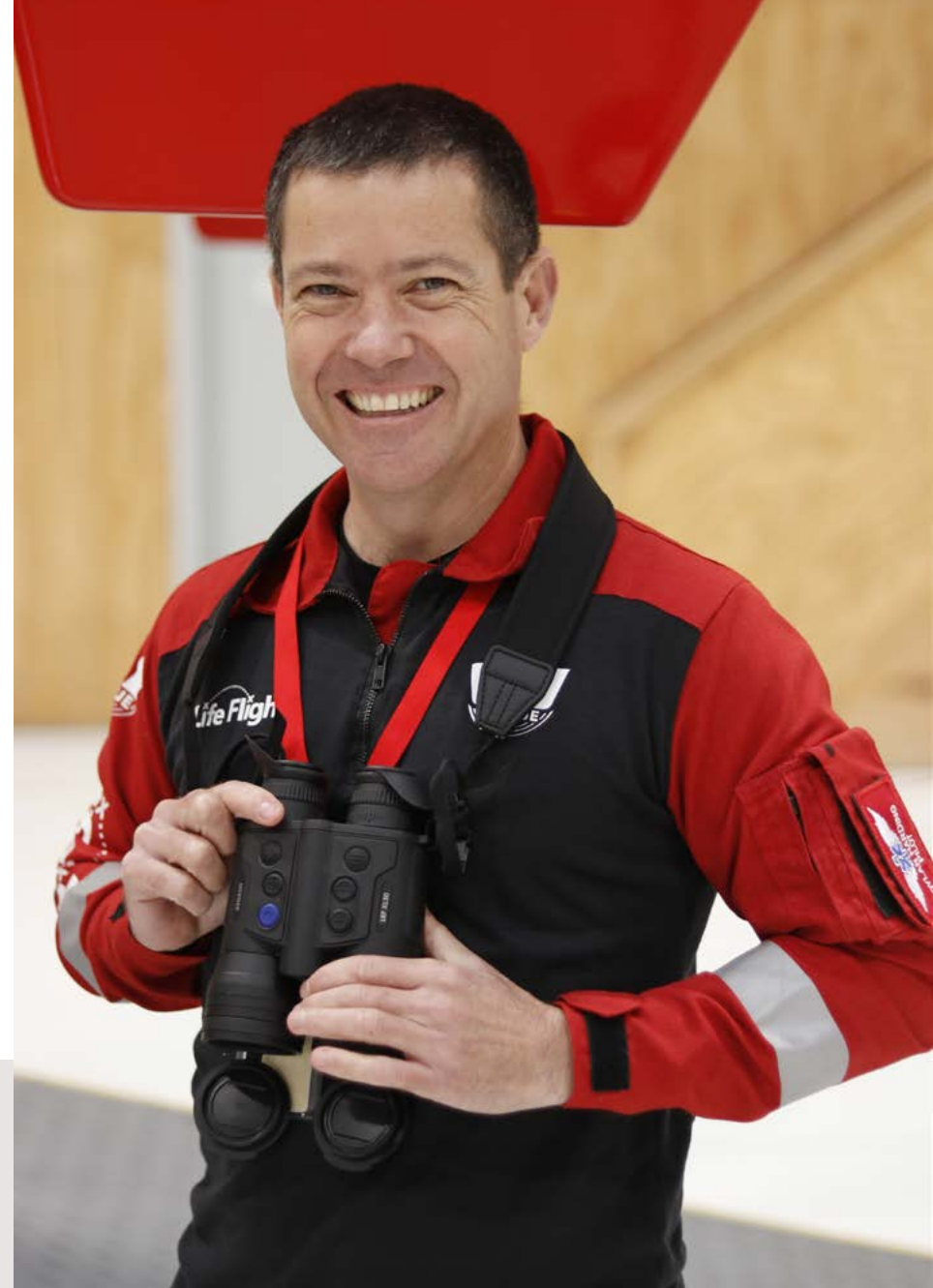
Pulsar Thermal Binoculars.