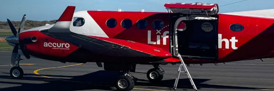
Air Ambulance waiting for its next patient.

Life Flight would like to thank the following organisations for providing essential goods and services to the Trust. Grants help Life Flight provide 24/7 aeromedical care and are hugely appreciated.