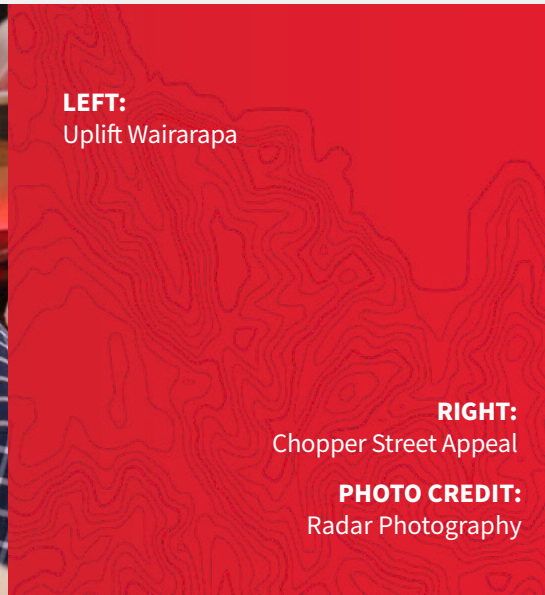
RIGHT: Chopper Street Appeal