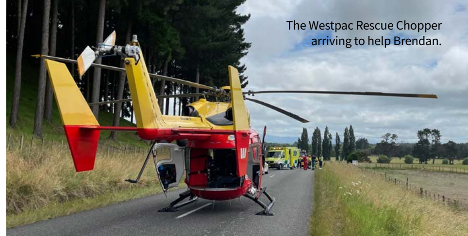
The Westpac Rescue Chopper arriving to help Brendan.

The crew loaded him onto the Westpac Chopper, and once safely secured, it only took 28 minutes to reach the Wellington Hospital.