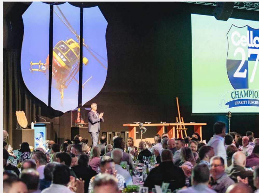
RIGHT: Champions luncheon