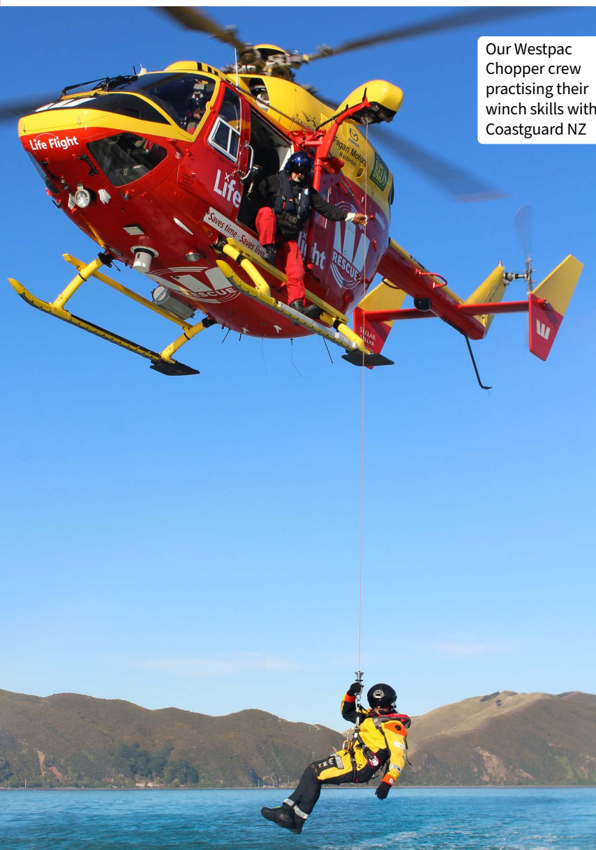
Our Westpac Chopper crew practising their winch skills with Coastguard NZ