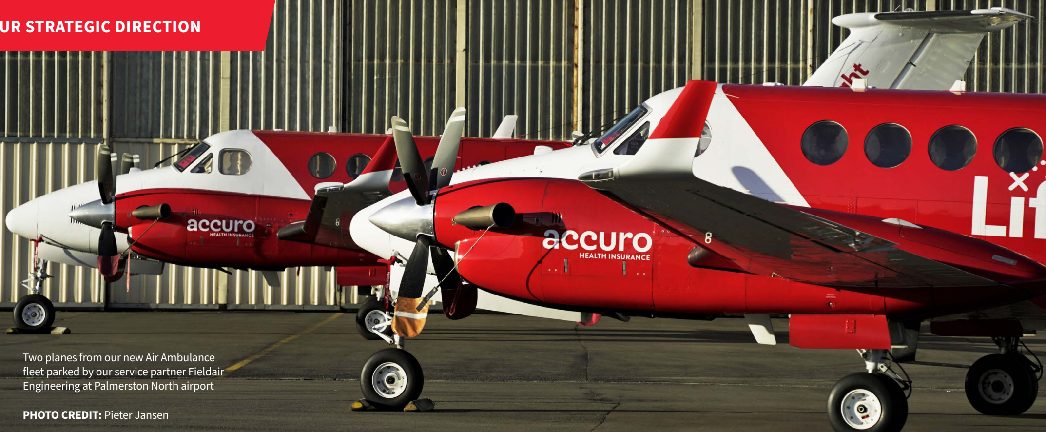
Two planes from our new Air Ambulance fleet parked by our service partner Fieldair Engineering at Palmerston North airport