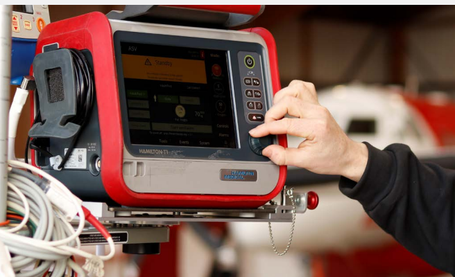
The new Hamilton-T1 Ventilator being prepared for its next job