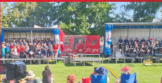
Mitre10 Mega Marlborough Christmas in the Park

We were thrilled to be chosen by partners and friends as their charity of choice for fundraising events; below are just a few! Thank you to the organisers for the incredible mahi that went into making these events such a success.