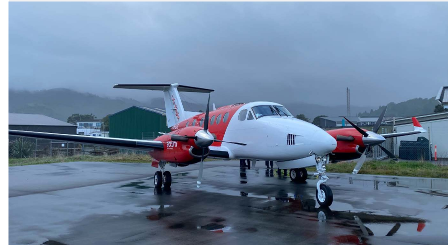
One of our new Air Ambulance planes on its first mission to Greymouth, July 2023

These Gifts in Wills will fund life-saving missions,