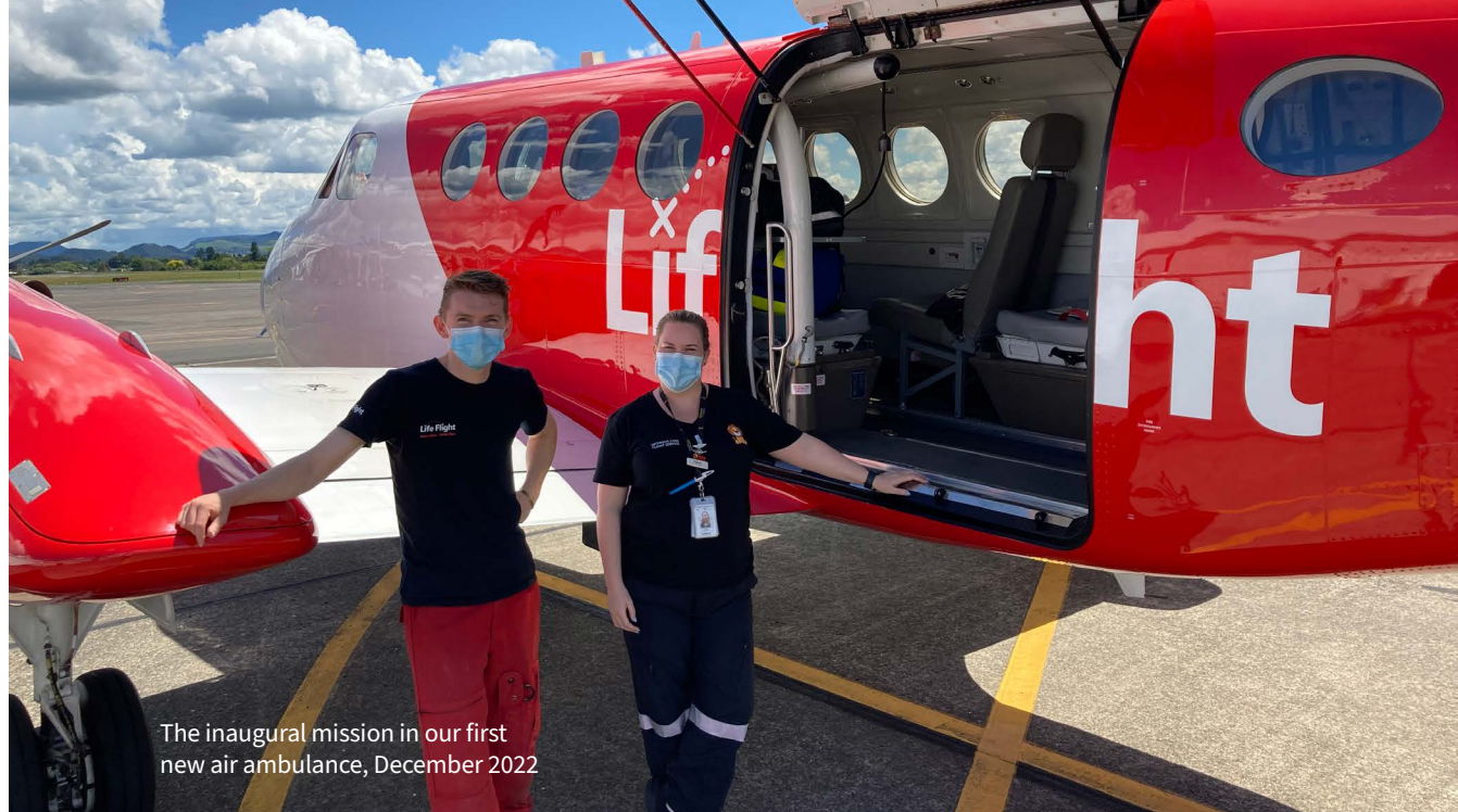
The inaugural mission in our first new air ambulance, December 2022

We are immensely grateful for the generous support we received in this financial year.