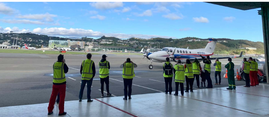
Life Flight team welcoming the first King B200C Air plane arriving into Wellington in July 2022

Costing around $8.0M, we utilised a variety of funding streams to finance this essential project, including a bridging finance loan from our Major Sponsor, Westpac. However, this project is only possible through support from our local community. During 2023 Life Flight plans to fully transition to King Air operations, while fundraising will continue to conclude this very special project.