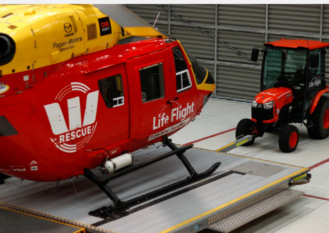
This custom designed trailer will enable safer missions, and easier Westpac Chopper maintenance