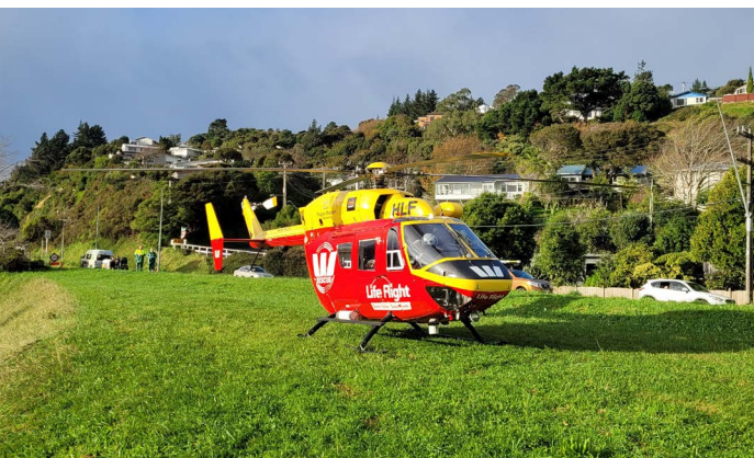
Our Westpac Chopper crew responding to a call out in Stokes Valley

Life Flight would like to thank these wonderful organisations for their ongoing support. Grants help Life Flight to provide 24/7 emergency air services 365 days a year and are hugely appreciated.