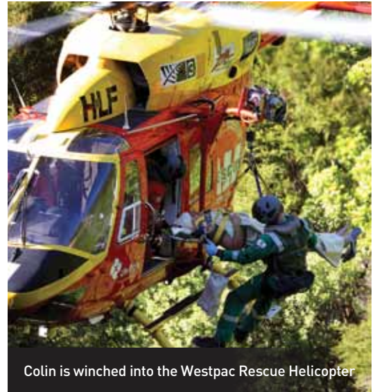
Colin is winched into the Westpac Rescue Helicopter