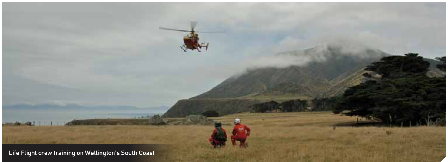
Life Flight crew training on Wellington's South Coast

Crouch while walking for extra rotor clearance. Always remove hats. Never reach up or chase after anything that blows away.