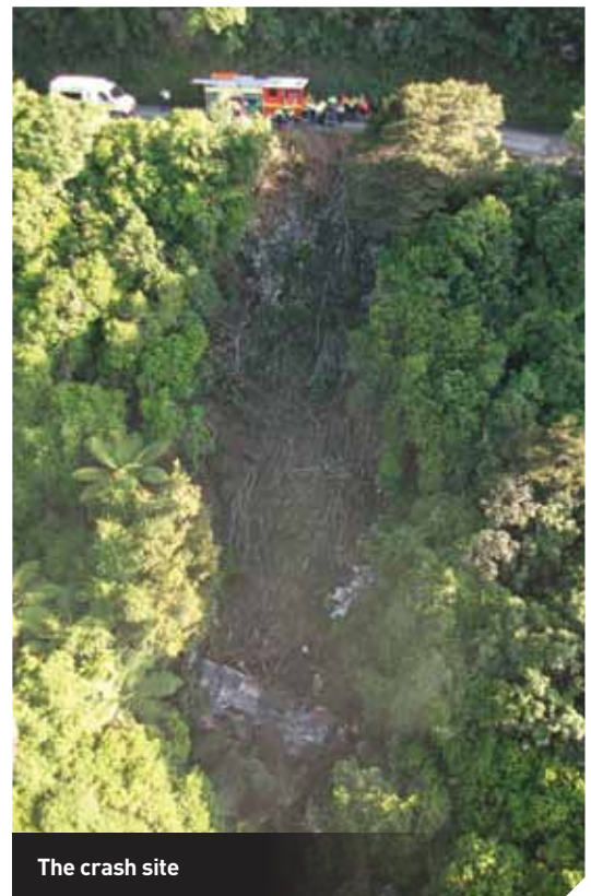
The crash site