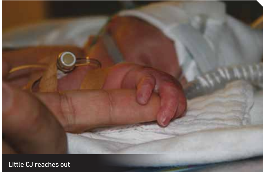
Little CJ reaches out