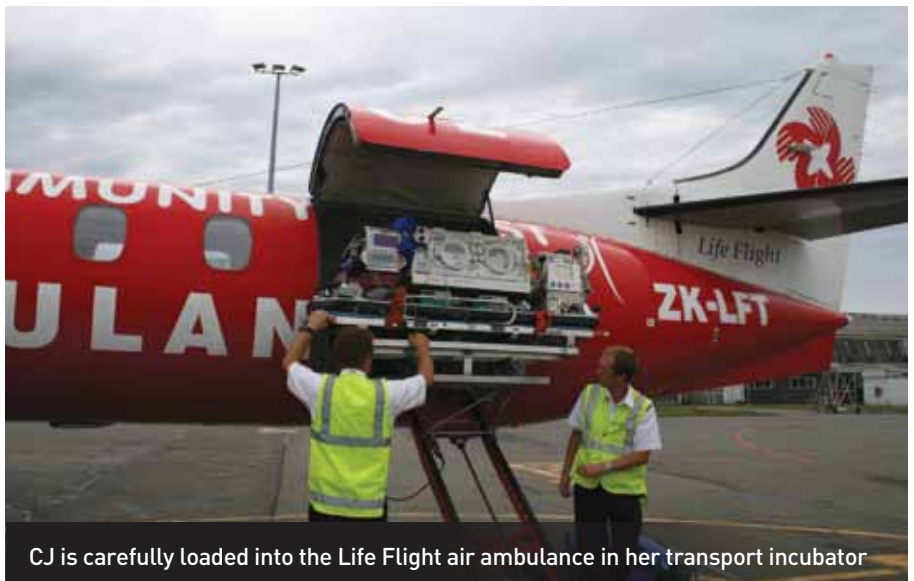
CJ is carefully loaded into the Life Flight air ambulance in her transport incubator