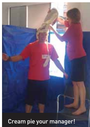
Cream pie your manager!