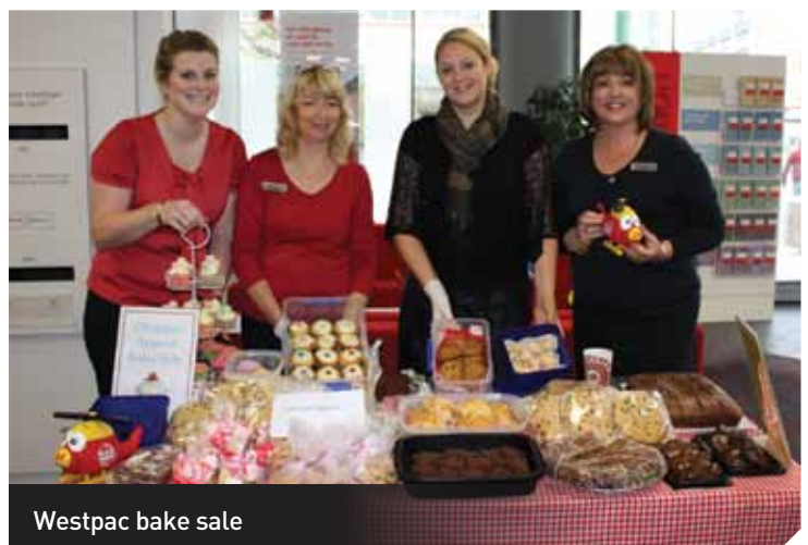
Westpac bake sale