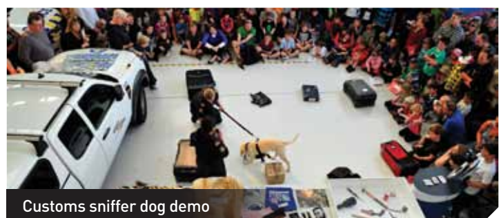
Customs sniffer dog demo

LIFE FLIGHT OPEN DAY: Thousands flocked to our base in May, raising nearly $13,000. This event wouldn't be possible without our wonderful service partners. Thanks also to the business supporters including: Classic Hits, TV3, The Dominion Post, Caffe L'affare, Air Castles, Premier Beehive, Hiremaster, PAK'nSAVE Kilbirnie, Vision Media, Rocket Bikes, Signature Promotions.