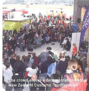
The crowd enjoys a demonstration by the New Zealand Customs "sniffer dogs"

Thanks to Caffé L'Affaire, Freestyle Total Print Production, Hiremaster, Watties, Tip Top, Hangdog Adventures, Tech Trans and Vidcom for supporting this event. ■