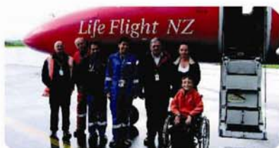
A young patient visits Life Flight's Auckland team to thank them for his flight on the Air Ambulance from Invercargill to Starship

Life Flight works very hard to ensure that your donations save peoples lives. All of our supporters, key service partners and sponsors are an essential part of that equation. I would like to draw attention in this newsletter to two very important supporters: the Starship Foundation and Wellington International Airport.