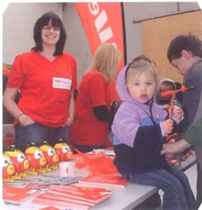
Westpac staff at Life Flight's recent Open Day.

All money raised in the greater Wellington region will go directly to Life Flight, so it's a great way to show your support for your local rescue helicopter service. During May, you can donate towards the Chopper Appeal at any Westpac Branch, at www.haveapart.co.nz or by calling 0900 4 CHOPPER to make an automatic $25 donation. For Kapiti residents, there is an auction in support of the chopper on June 23rd. For tickets, contact Westpac Paraparaumu branch. ■