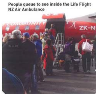
People queue to see inside the Life Flight NZ Air Ambulance